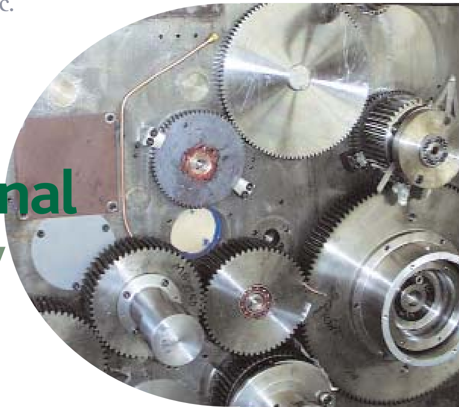
THE TYPICAL DIECUTTER HAS NUMEROUS POWER TRANSMISSION POINTS. BACKLASH CAN QUICKLY BECOME A SIGNIFICANT FACTOR IN CONTROLLING SIZE.

Size variation, or fluctuation within an order, is typically not caused by the cutting die, as I discussed in the first part of this series. However, the die is more times than not blamed for the variation. The importance of developing a comprehensive knowledge of the variables that influence dimensional stability in order to enhance troubleshooting skills and efficiency was also stressed.